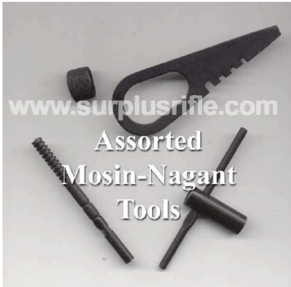
Clockwise from ten o'clock: bore guide, multi-tool (screw driver and firing pin protrusion gauge), cleaning rod handle, and cleaning jag.