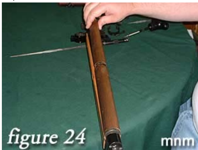
20) Remove upper handguard.