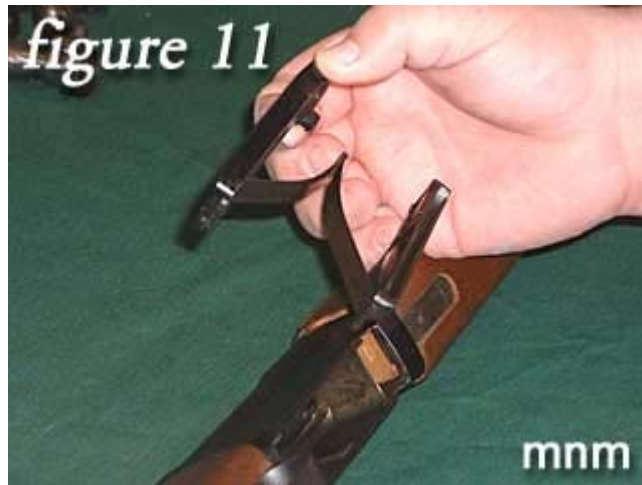
9) Remove the magazine cover.