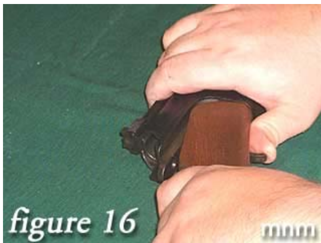
12) Move the rear stock back a little. While holding the trigger back remove the stock.