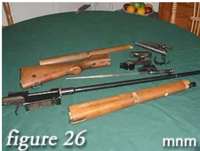
22) Figure 26 shows a disassembled MAS 36 rifle.