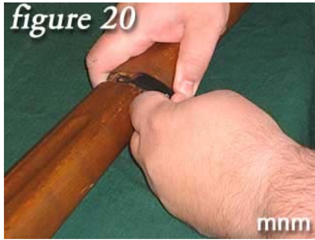
16) Remove handguard band.