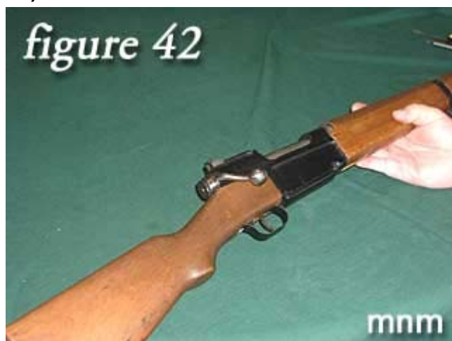
14) You are finished assembling the rifle.