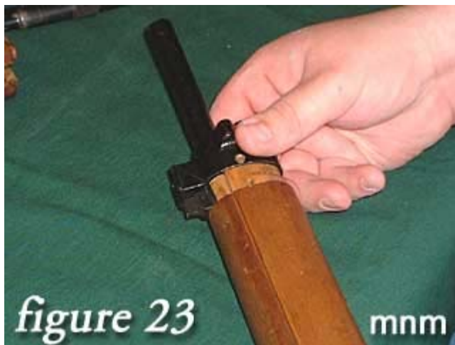
19) Remove front barrel band