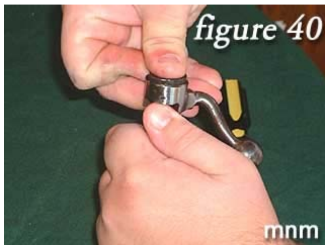
12) While depressing bolt end, rotate counter clockwise until it locks into place.