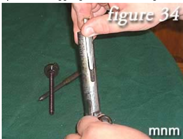
8) While holding bolt body, slide extractor back and lock into place.