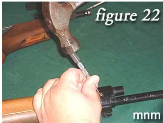
18) If you do not have a two point wrench then take a very small punch and at an angle, tap the screw counter clockwise until enough of the screw head is exposed to locked onto with vise grips.