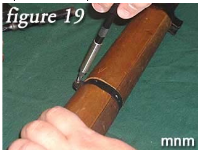
15) Remove screw in handguard band.