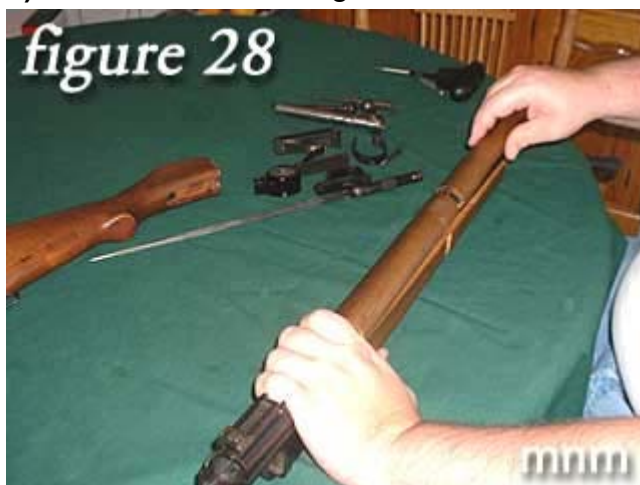
2) Reinstall upper handguard.