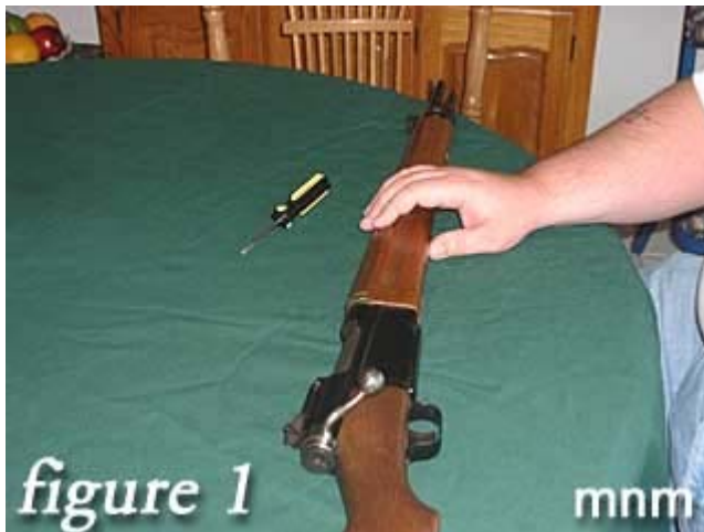
Figure 1 shows a typical MAS 36 rifle.