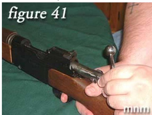
13) Insert rifle bolt.