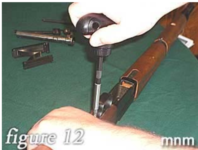
10) Remove the screw at the rear of the trigger guard.