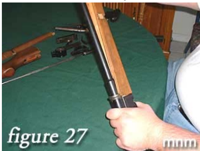
1) Reinstall lower handguard.