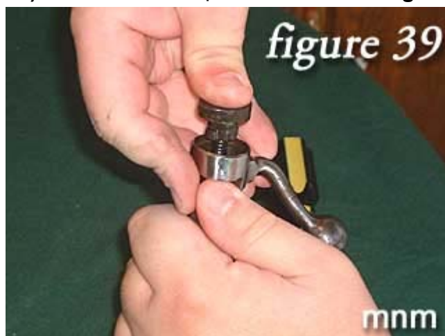
11) Insert bolt end and spring.