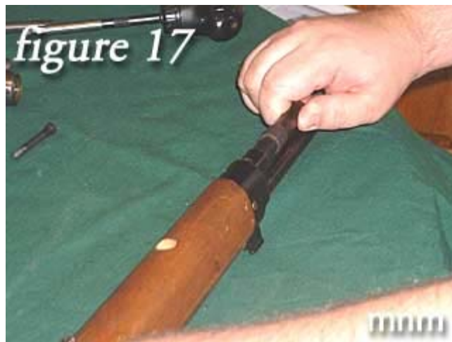
13) Depress the bayonet release.