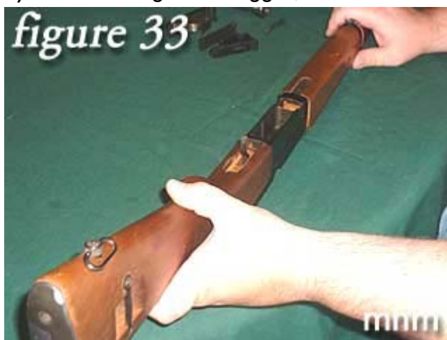
7) Reinstall trigger guard and retaining screw..