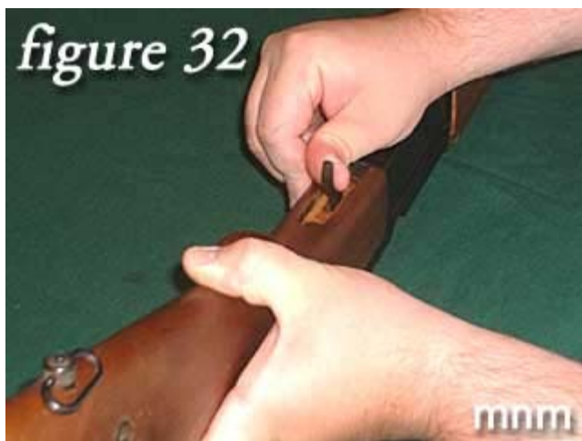
6) While holding down trigger, reinstall rifle stock.