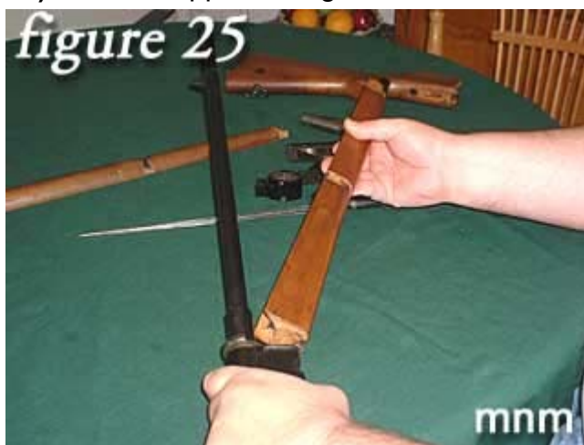
21) Remove barrel and receiver assembly from lower handguard.