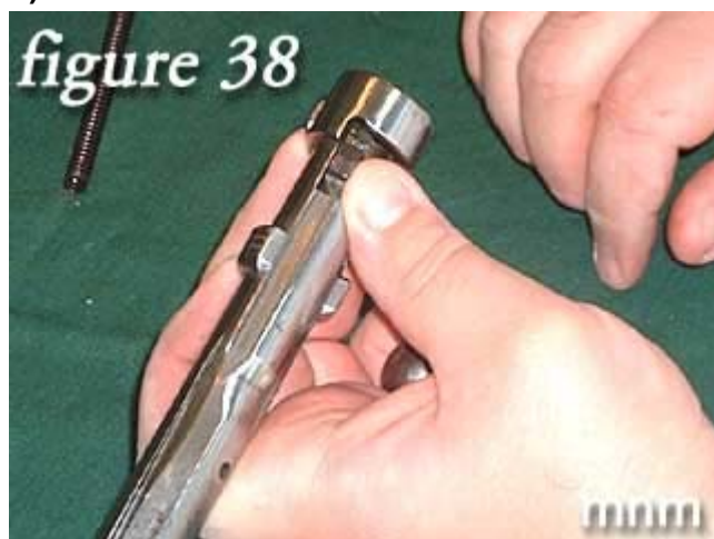
10) Lock striker into place as shown in figure 38 .