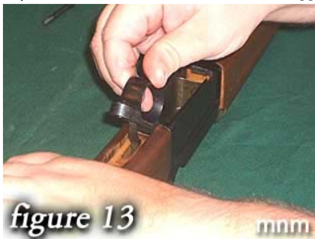
11) Lifting from the rear to the front, remove the trigger guard.