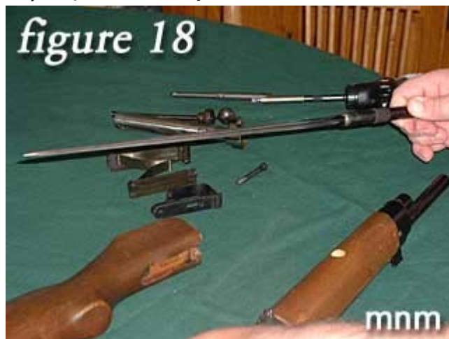
14) Remove the bayonet.