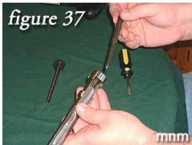
9) Insert striker.