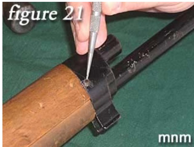
17) Figure 21 shows a two point style screw, requiring a two point wrench.